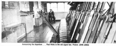
Midland old signal box Waiting for the end of the day, Paul Hicks, aged 18, looks at the lever frame in the Midland old signal box. The apparatus is the last of its kind and is being preserved in a place of honor at the NRM.