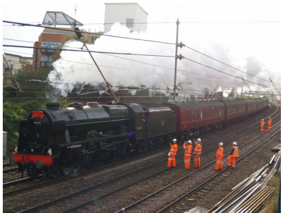
Sunday 9th November 2014, a fine sight past the box!