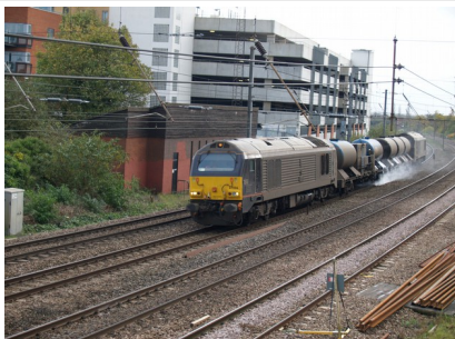
A sure sign that autumn is here; the Rail Head Treatment Train makes one of its 4 times a day trips past the box.

There will be a Christmas Party in the Signal Box on Saturday 13th December from 7.00pm. Drinks and nibbles will be served, please do come along and bring the family. Please let Richard Kirk know if you are coming - contact details below.